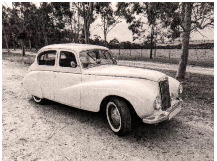
The Car in Question - the Sunbeam Talbot 90