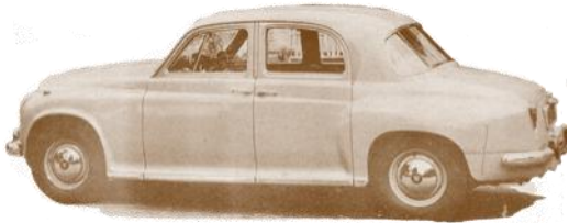
1955 Rover 90