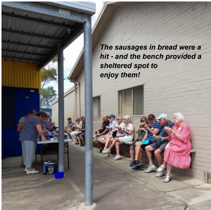
The sausages in bread were a hit - and the bench provided a sheltered spot to enjoy them!